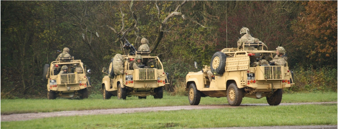
The Sqn on exercise