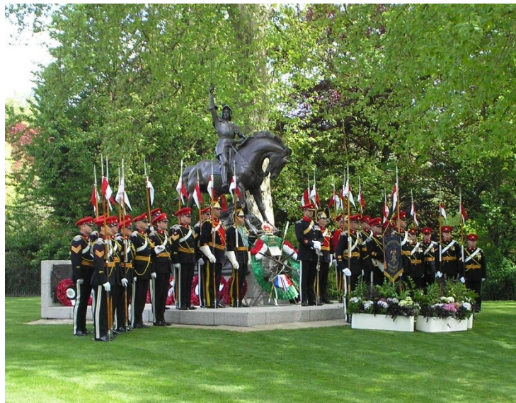
The Cavalry Memorial, Hyde Park