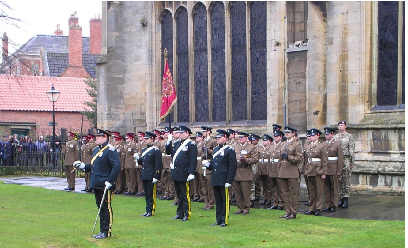
The Sqn on parade at Newark

As usual, the Sqn paraded in Newark on Remembrance Day. Afterwards, all gathered for a curry lunch at Carlton which was also attended by members of the SNH Association.