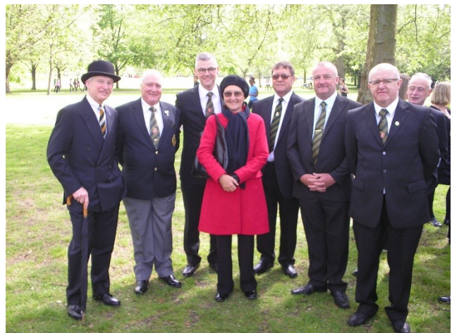
Before the parade last year