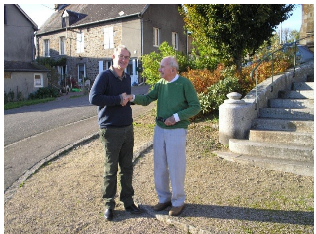
Thank you and goodbye at Berjou