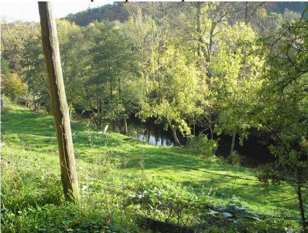
A Sqn crossing point

A Sqn crossed about 1 Km further east, near the factory at le Rocray. They then took a small track through the wood towards le Hamel. We were able to find this track which is extremely narrow for tanks and it is perhaps no surprise that their advance faltered as the tanks got separated in the trees.