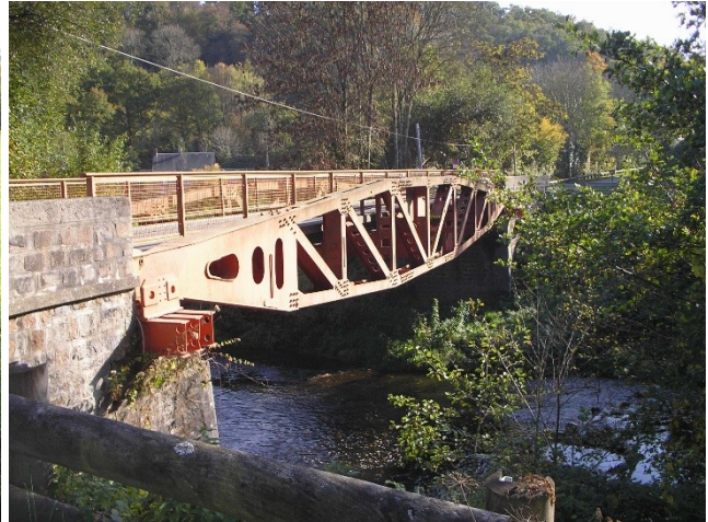
The bridge at the station at Cambercourt (rebuilt after the War with a span from the Mulberry harbour)

A Sqn crossed about 1 Km further east, near the factory at le Rocray. They then took a small track through the wood towards le Hamel. We were able to find this track which is extremely narrow for tanks and it is perhaps no surprise that their advance faltered as the tanks got separated in the trees.