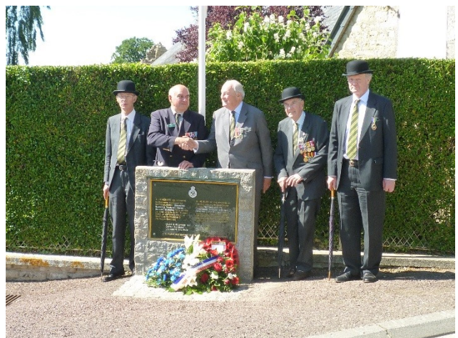
At the SRY memorial at Hélie Farm at St Pierre