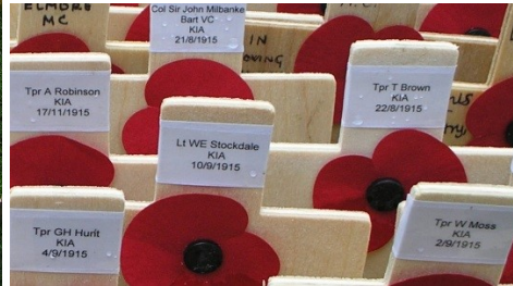
Gallipoli memorial crosses