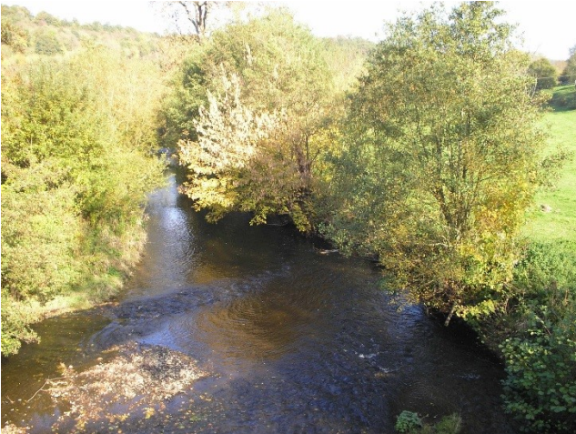
The river Noireau near where C & B Sqns crossed

At the time of the battle, Condé was still occupied by the Germans, so the 43 rd (Wessex) Div, supported by the 8 th Armd Bde crossed the Noireau further east, moving parallel to the river behind the ridges on the north bank which shielded them from the view of the Germans on the heights of Berjou. There were no bridges left standing on that stretch and, while it is not very wide, the banks are steep and the tanks could not cross until fords had been made. B and C Sqn crossed near the railway station at Cambercourt, about 1 Km east of the start of the road up to Berjou, which they then climbed as described by Stuart Hills.