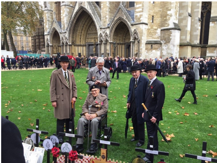
Before the ceremony

This year the ceremony will be held on Thursday 10 th November. For security reasons, tickets are required. So, if you would like to attend, please let me know by the beginning of September.