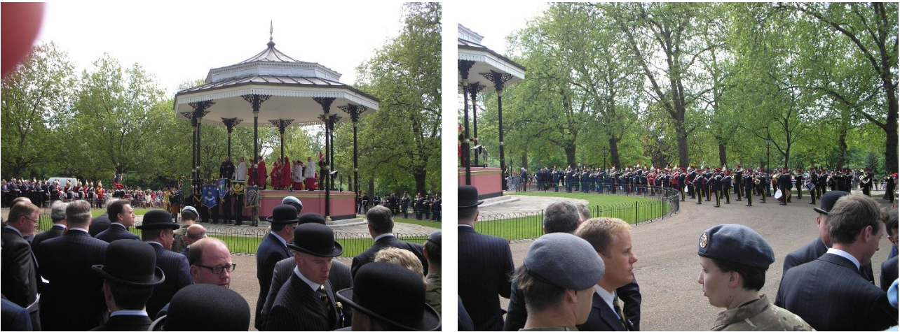
Cavalry Memorial Parade 2015