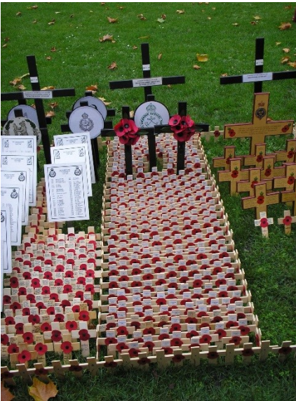
The SRY Plot