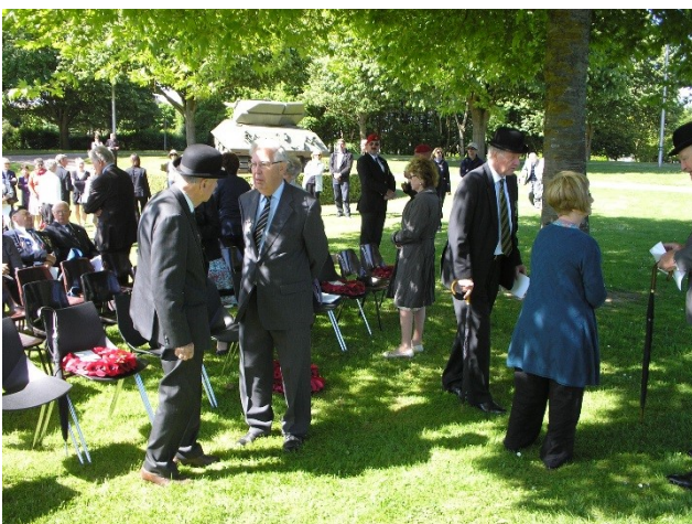
Before the ceremony at Bayeux Museum